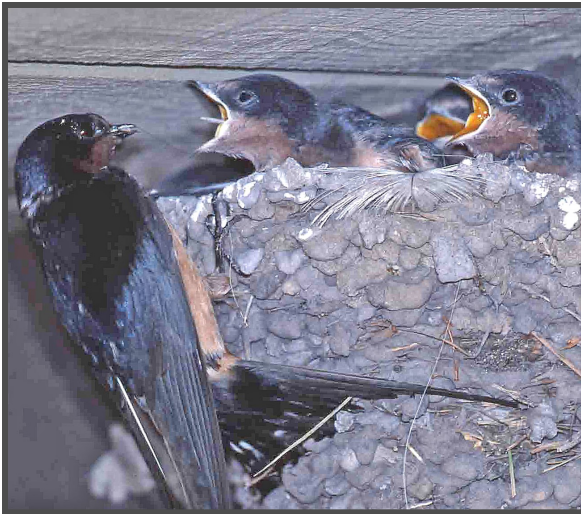
James R. Gallagher, Sea & Sage Audubon

Birds and active nests are protected by the Migratory Bird Treaty Act. It is illegal to possess native birds, their eggs or nests, or keep any wild bird as a pet. Rehabilitation of native wild birds must be done by a permitted Wildlife Rehabilitator.